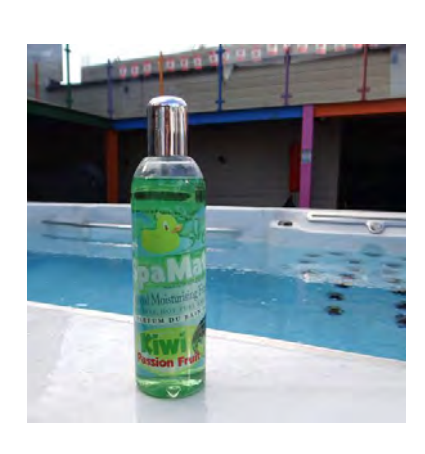
KIWI PASSION FRUIT