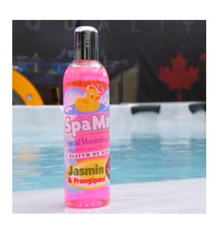
JASMIN & FRANGIPANI