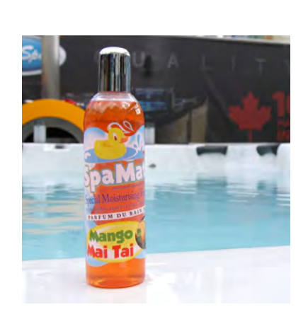
MANGO MAI TAI